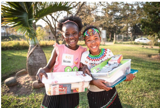
Taken from the Operation Christmas Child newsletter